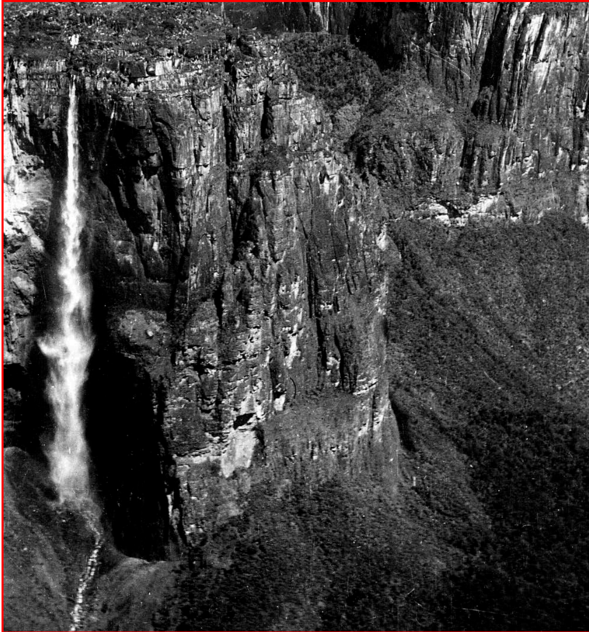
Angel Falls • Churún Vena • Salto Angel