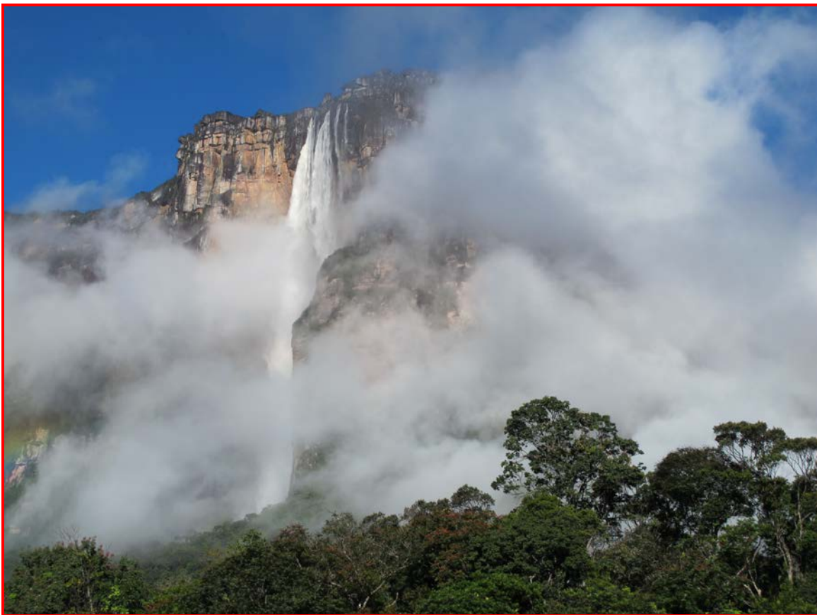
Morning at Angel Falls • Churún Vena • Salto Angel